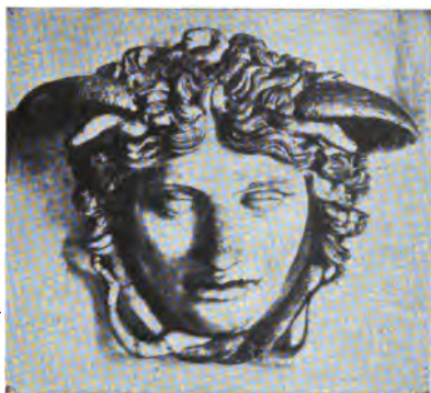
Fig. 61. Head of Medusa.

way. Inviting a number of young men to a feast, he asked them each to bring him some valuable gift. Perseus impulsively declared that he was ready to attempt anything, even to getting the head of the gorgon Me du'sa, the most impossible feat imaginable. Now Medusa had once been a beautiful maiden, who was over-proud of her beauty, and especially of her glorious hair.